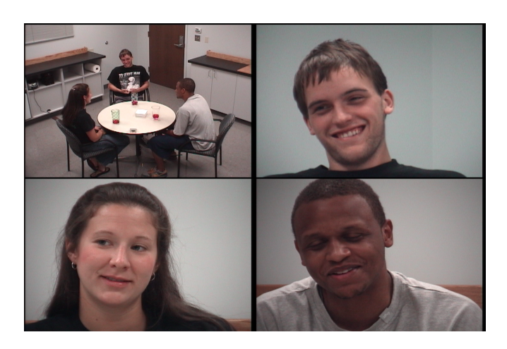
Fig. 1. Example of the overhead and individual camera views

The Facial Action Coding System (FACS) [8, 9] is an anatomically-based system for measuring nearly all visually-discernible facial movement. FACS describes facial activities in terms of unique action units (AUs), which correspond to the contraction of one or more facial muscles. FACS is